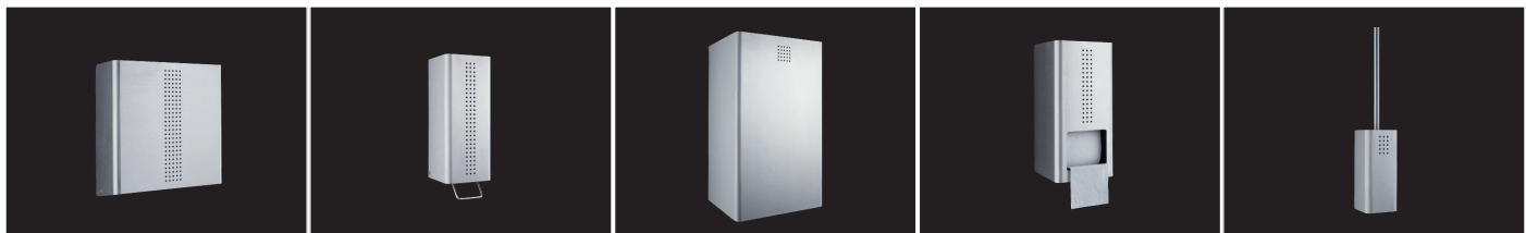
paper towel dispenser PU-100