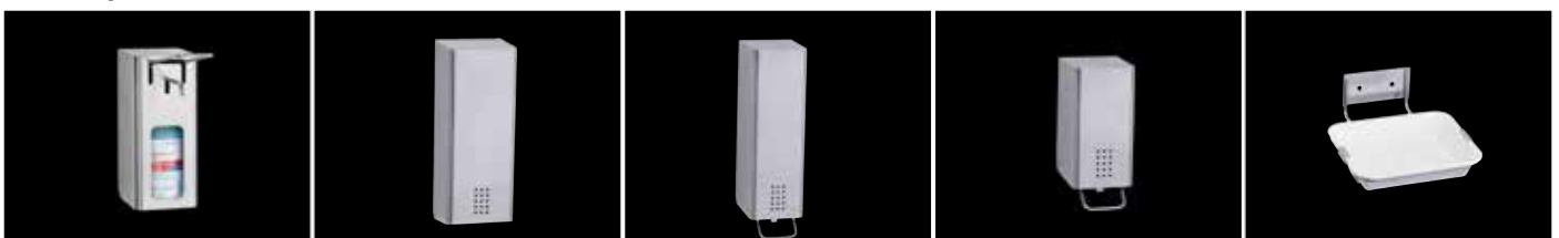
hospital dispenser PU-141-EB